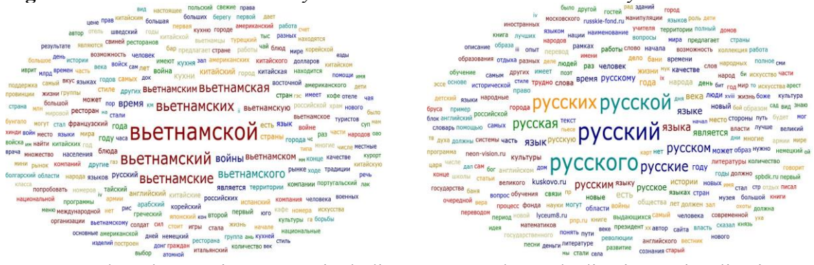
Figure 1. Vietnamese Perceived by Russians and Russians Perceived by Russians

Note. Based on the Russian corpus, including nouns, verbs, and adjectives. Visualization: Atlas.ti.