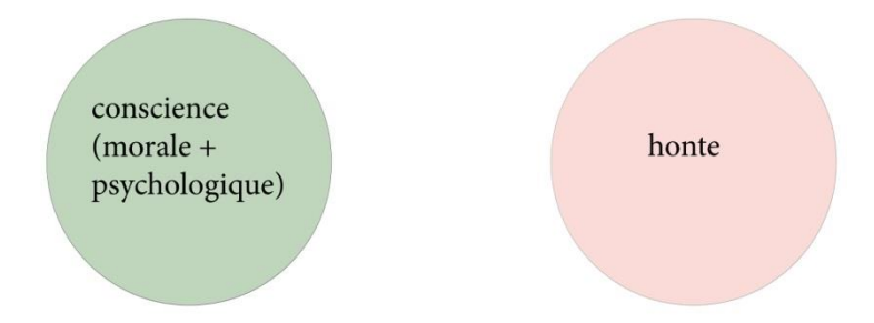
Figure 2. Semantic relations between conscience, shame and consciousness in the French language

Let us consider semantic links between conscience, consciousness and shame in the parallel corpus of the Russian and French languages, which is a part of the National Corpus of the Russian language. The total number of examples containing the lexeme conscience in the original or translated texts is 686. They can be found in 37 works, of which 22 works are in Russian, 15 are in French<sup>2</sup>.